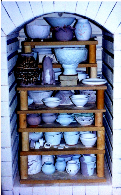
Kiln loaded with pottery ready for firing.

At the Hildav Potters warehouse we run a firing service for people who would like to do ceramics or pottery but don't have a kiln.