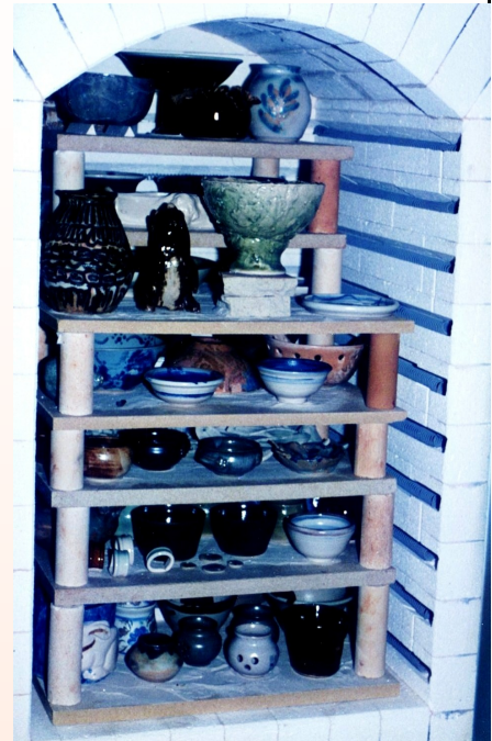
The same kiln after firing.

There are several ways in which we can help so read the information below to see what we can do for you.